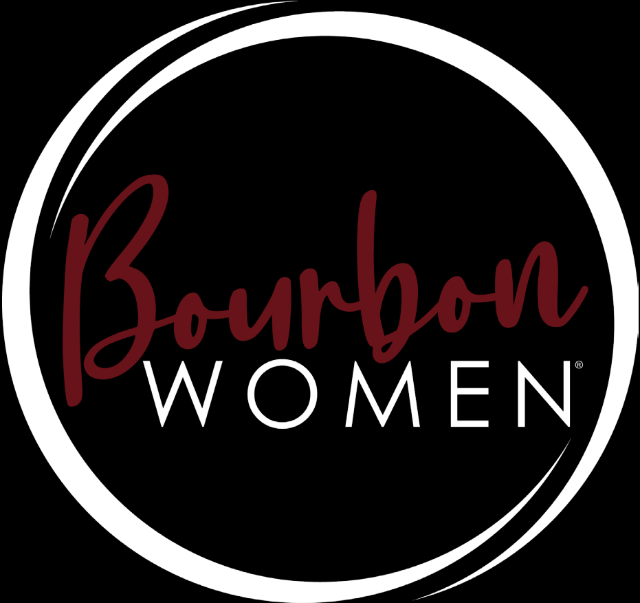
BURGUNDY AND WHITE LOGOS